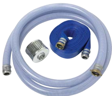
2" PIN LUG HOSE KIT - PART # CB67026