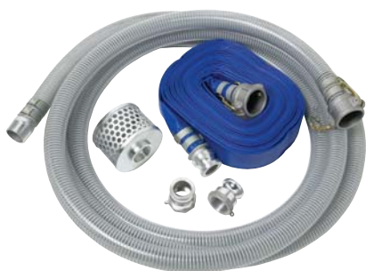
2" CAMLOCK HOSE KIT - PART # CB67023