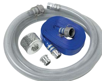
3" CAMLOCK HOSE KIT - PART # CB67024