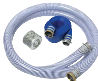
3" PIN LUG HOSE KIT - PART # CB67027