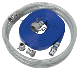
1" CAMLOCK HOSE KIT - PART # CB67022